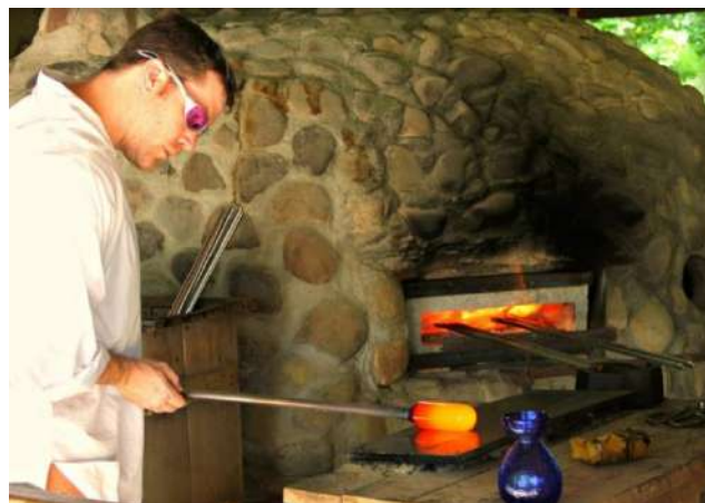
Glassmaking today at the Glasshouse at Historic Jamestowne, part of Historic Colonial National Park, Virginia

The Virginia Company of London lost its charter in 1624 and Jamestown became part of the Royal Colony. After the government house in Jamestown burned for the third time, the House of Burgesses voted to relocate to Middle Plantation in 1698, which soon thereafter was renamed Williamsburg.