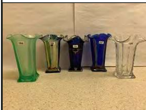
Dugan Diamond 4 sided vases

The auction will start at 2:00 PM EST. Watch the website for more information and to register to bid. https://www.matthewwrodauctions.com/