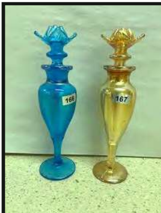
Fenton Cologne bottles