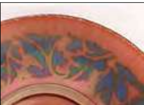
US Glass Pomona

Enamel paint was often applied to the surface of stretch glass. Lancaster was famous for using three basic effects. The pieces would have been decorated with a floral pattern, then the entire outer surface would have been sprayed with a contrasting enamel color. Ruby Lustre is a documented term used for an overall yellow to red-orange enamel (Fig. 13). When an overall cream to green enamel was used, we call it Green Lustre (Fig. 12), and when an overall white enamel was used, we call it White Lustre (Fig. 11).