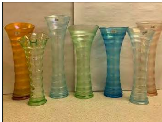
Fenton Ring Optic vases