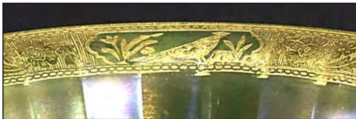
Northwood Pheasants and Stump