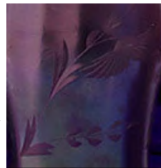
Fenton Floral Cut

Glass cutting usually uses rotating wheels with either diamond powder or another cutting element that can cut a design into the surface of glass. After cutting, buffing wheels can polish the design, but in some cases the design is not polished and will appear as having a cloudy surface. Unfortunately, on stretch glass, cut designs are often difficult to see (Fig. 17, floral cut on Fenton Wistaria; Fig. 19, balls and line cut - often called “matchstick” - on Fenton Topaz). The designs are much easier to see when the cutting is through something like smoke or marigold on crystal glass (Fig. 18, floral cut on Imperial Blue Ice; Figs. 20 & 21, floral and line cuts on Fenton Grecian Gold). Most cuttings appear to have been done in the manufacturers’ shops, though it appears that some cuttings may have been done by secondary decorating companies. Imperial appears to have had one of the most extensive cutting operations, followed by Fenton.