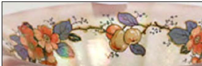
Imperial Floral Band

Acid-Etch Designs Returning to the etched designs, virtually all of the stretch glass pieces with etched band designs appear to have been decorated by the Wheeling Decorating Company. This company purchased blanks from several companies, including Fenton and Northwood stretch. The two most common acid-etched bands are: "Fingered Swirls, Arrows, and Flowers" (Fig. 3, Fenton #647 bowl in Persian Pearl; Fig. 7, Fenton 621 cupped vase in Ruby) and "Drapes" (Fig. 4, Fenton #8 candy jar in Celeste Blue & Fig. 5, Northwood console set in Blue). A very rare decoration is "Pheasants and Stump" (Fig. 6, Northwood #633 bowl in Topaz) which I've only personally seen twice.