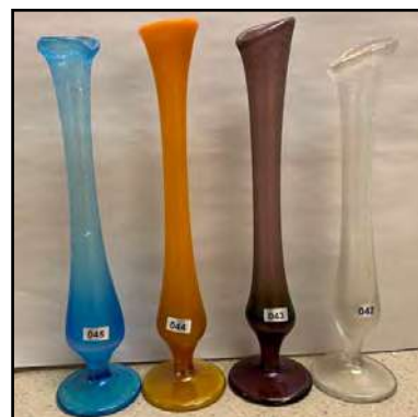
Fenton #251 vases