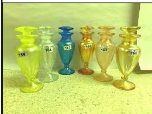
Fenton Cologne bottles