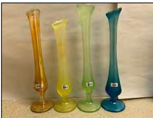
Fenton #251 vases