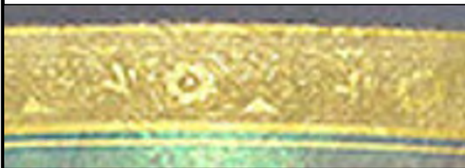
Fenton Fingered Swirls, Arrows, and Flowers