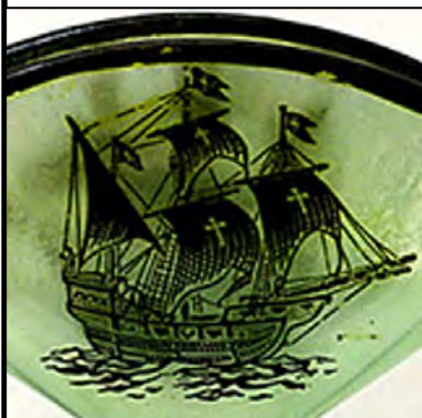
Fenton Santa Maria design