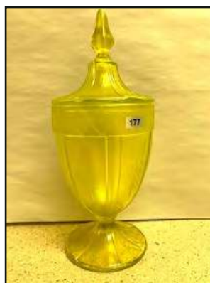
Northwood Candy Jar in Topaz with rare cuttings