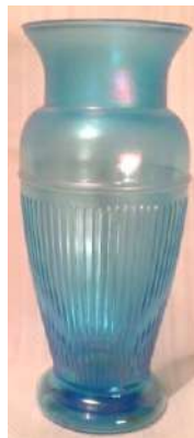
Diamond blue Adam's Rib vase, $381.69, 3 bids, 6/8/13