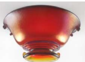
Imperial red Double Scroll bowl, $167.50, 4 bids, 7-26-13