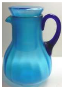
Fenton Celeste Blue guest set, $139.50, 11 bids, 6/8/2013