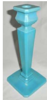
"Northwood ~ NW- 651 Candlestick ~ Jade Blue ~ Very rare!" (with small chip)