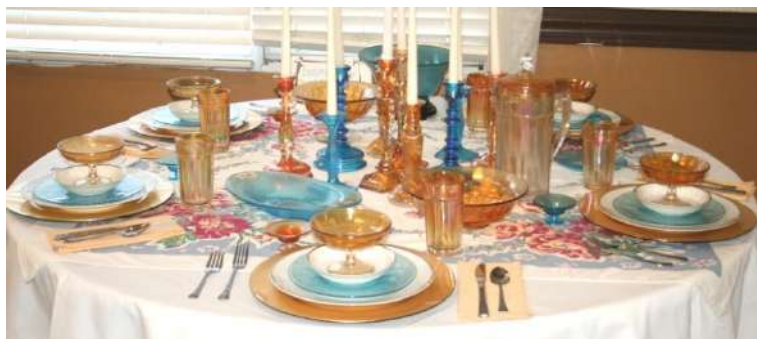
Renée & Dave Shettlar's table setting display