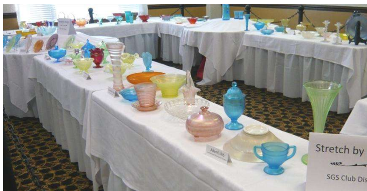
Hard to capture this year's wonderfully large SGS Club Display.