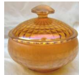
Fenton Tangerine Diamond Optic #43 puff jar, $686.76, 17 bids, 7-14-13