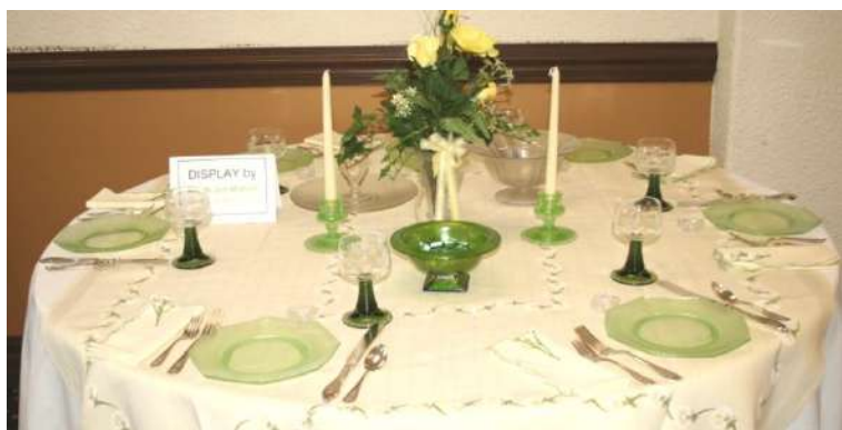
Ann and Jim Midlam's table setting display