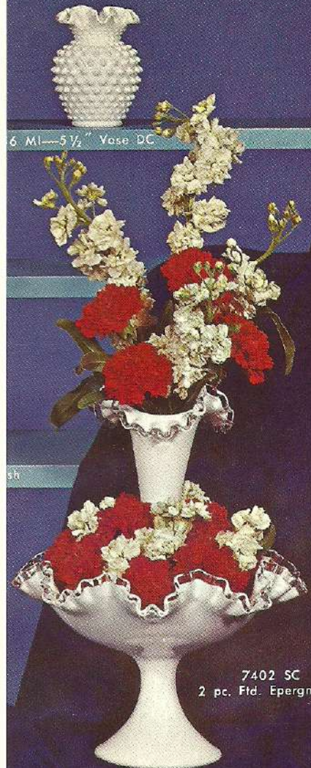
7402 SC 2 pc. Fld. Epergne Set