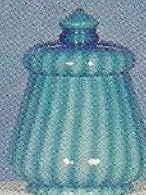
1680 OB—Cvd. Candy Jar