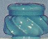
6080 OB—Candy Box