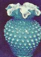
3656 OB 5 1/2" Vase

The rich blending of traditional and contemporary design in these unusual and brilliantly new decorator colors adapts the Fenton line to any home. The