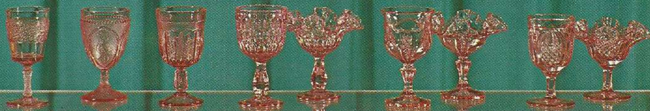
6345 CP Flower Band Goblet 9145 CP Stippled Scroll Goblet 3445 CP Cactus Goblet 4445 CP Thumbprint Goblet 4429 CP Thumbprint Ftd. Comport 9245 CP Empress Goblet 9229 CP Empress Ftd. Comport 9045 CP Pineapple Goblet 9129 CP Pineapple Ftd. Comport