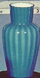
1750 OB 10 1/2" Vase