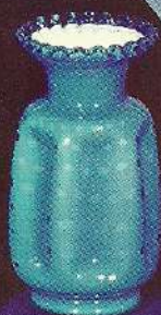
1358 OB 8" Pinch Vase