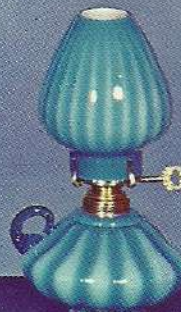
1691 OB—Courting Lamp (electric)