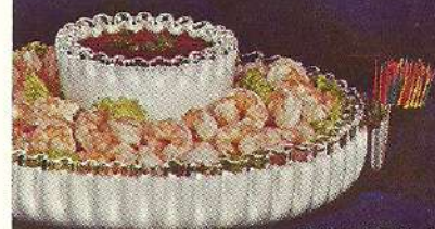
7403 SC Shrimp 'n Dip with Toothpick