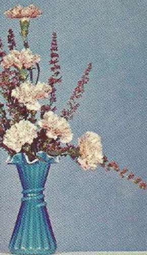
5858 OB—8" DC Vase