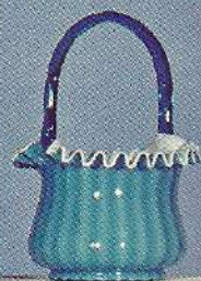
1637 OB—7" Deep Basket