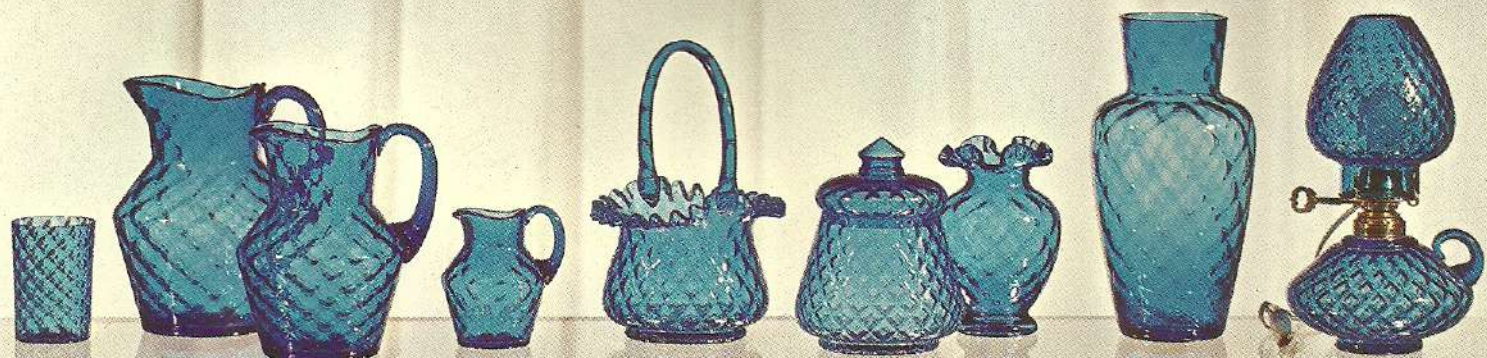
1740 CB 10 oz. Tumbler 1766 CB 64 oz. Pitcher 1764 CB 44 oz. Pitcher 1761 CB 10 oz. Pitcher 1737 CB 7" Deep Basket 1780 CB Cvd. Candy Jar 1751 CB 7" Vase 1750 CB 10 1/2" Vase 1791 CB Courting Lamp (electric)