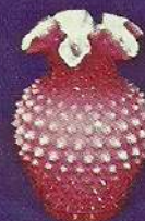
3656 WR 5 1/2" Vase