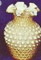
3656 HA 5 1/2" Vase