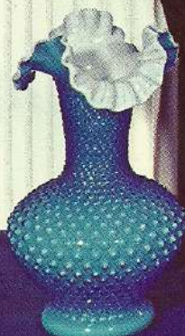
3752 OB 11" Vase