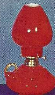
1690 PA—Courting Lamp (oil)