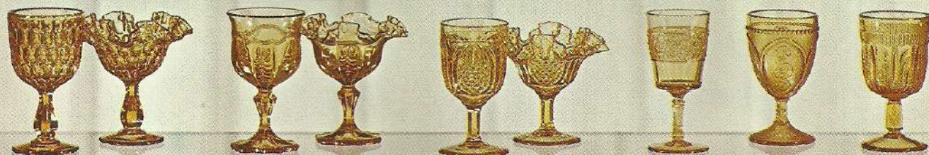
4445 CA Thumbprint Goblet 4429 CA Thumbprint Ftd. Empress Comport 9245 CA Empress Goblet 9229 CA Empress Ftd. Comport 9045 CA Pineapple Goblet 9129 CA Pineapple Ftd. Comport 6345 CA Flower Band Goblet 9145 CA Stippled Scroll Goblet 3445 CA Cactus Goblet

BW—BLACK & WHITE CP—COLONIAL PINK CA—COLONIAL AMBER OB—OPAQUE BLUE CB—COLONIAL BLUE PA—PLATED AMBERINA