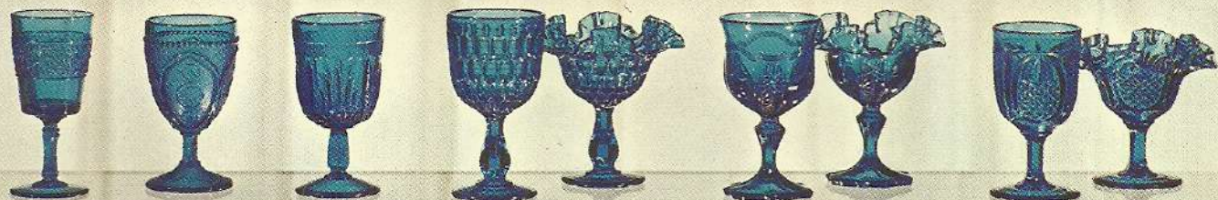
6345 CB Flower Band Goblet 9145 CB Stippled Scroll Goblet 3445 CB Cactus Goblet 4445 CB Thumbprint Goblet 4429 CB Thumbprint Ftd. Comport 9245 CB Empress Goblet 9229 CB Empress Ftd. Comport 9045 CB Pineapple Goblet 9129 CB Pineapple Ftd. Comport

We have admired the originals of these reproduction goblets for so long that we could no longer resist picking out the six most attractive to offer in these three new colors. Dating back to the 1870's, these patterns are eagerly sought by collectors today.