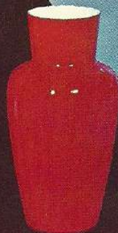
1750 PA 10 1/2" Vase