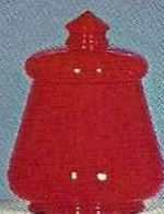
1680 PA—Cvd. Candy Jar