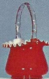
1637 PA—7" Deep Basket