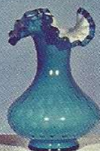
1356 OB—7 1/2" Vase