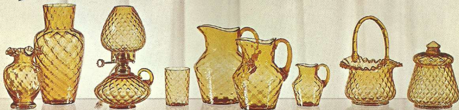
1751 CA 7" Vase 1750 CA 10 1/2" Vase 1791 CA Courting Lamp (electric) 1740 CA 10 oz. Tumbler 1766 CA 64 oz. Pitcher 1764 CA 44 oz. Pitcher 1761 CA 10 oz. Pitcher 1737 CA 7" Deep Basket 1780 CA Cvd. Candy Jar