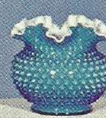
3850 OB—5" Vase